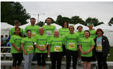
TEAM N.E.W. COMMUNITY CLINIC

13 employees from the clinic participated in this year's Bellin Run / Walk. This was a great way for all to promote a healthy lifestyle and spend time together outside the clinic.